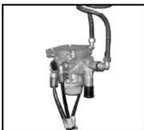
Pneumatic braking system 8000-10000-12000-14000 kg PN 008