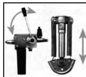
Hydraulic braking system with tractor pedal if supplied 8000-10000-12000-14000 kg PN 020