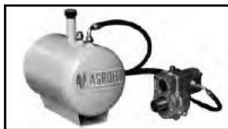
Pump with oil tank and universal joint